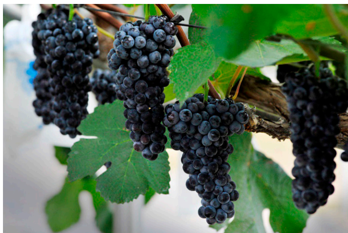
Fig. 2. Appearance of ‘Black Sun’ grape.

When the fruits of ‘Black Sun’ are fully mature, they are the same black color as the reference cultivar (Fig. 2). The cluster and berry shapes are conical and circular, respectively, making them commercially viable. The berries are in close contact but are small and do not require berry thinning. Berry cracking and dropping are observed very rarely. The average cluster and berry weight of ‘Black Sun’ are 338.5 g and 2.2 g, respectively, which are \sim 200 g and 0.4 g heavier than those of the reference cultivar. Total soluble solids (TSS) of ‘Black Sun’ are 20.8°Brix, and the titrateable acidity (TA) is 1.0%. Although the TSS value is marginally high, the ratio TSS/TA, an important index for determining the taste preference of consumers, has a lower level than that (29) of common table grape cultivars such as Campbell Early in Korea due to the high TA value. However, Bae et al. (2020) reported that ‘Black Sun’ can be a resource to produce wine, and Park et al. (2021)