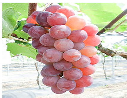
Fig. 2. Cluster appearance of the Red Dream grape cultivar.

As with other triploid grape cultivars, because of their extremely low fertility (Heo and Park, 2015), a single application of 100 ppm of GA 3 at full bloom is necessary to induce normal fruit setting and growth in ‘Red Dream’. Cluster and berry shapes of ‘Red Dream’ are conical and round, respectively. It is a slipskin grape. It produces juicy fruits, but the fruits of ‘Red Dream’ have a